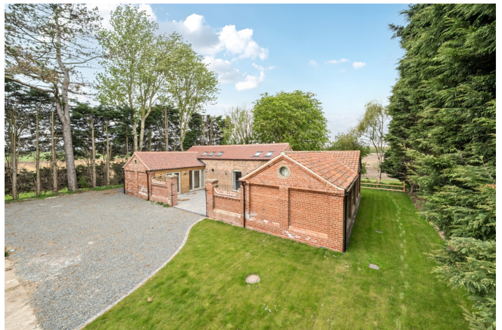
Willow Tree Barn, Anwick Fen, Sleaford, Lincolnshire, NG34 9SY