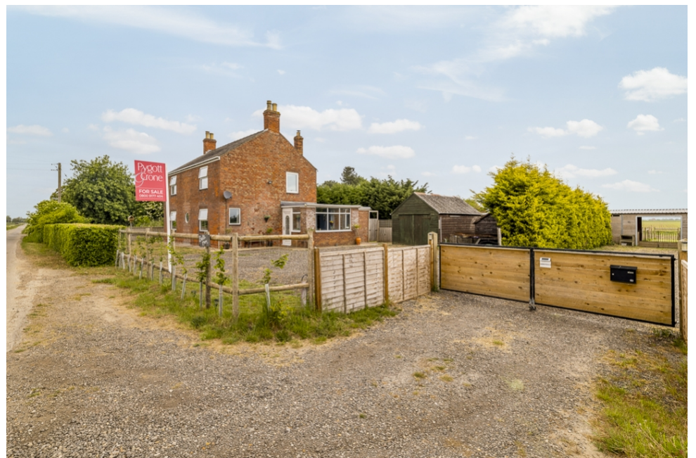
Bells Farm, Mere Drove, Old Leake, Boston, Lincolnshire, PE22 9QF