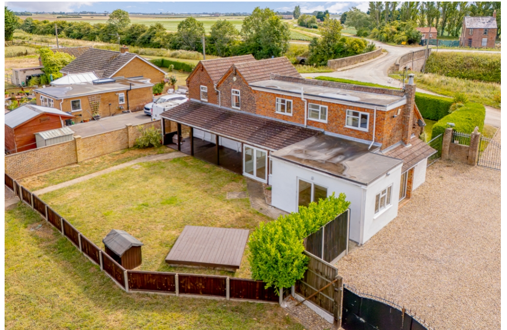
School House, Freiston Ings, Boston, Lincolnshire, PE22 0PX