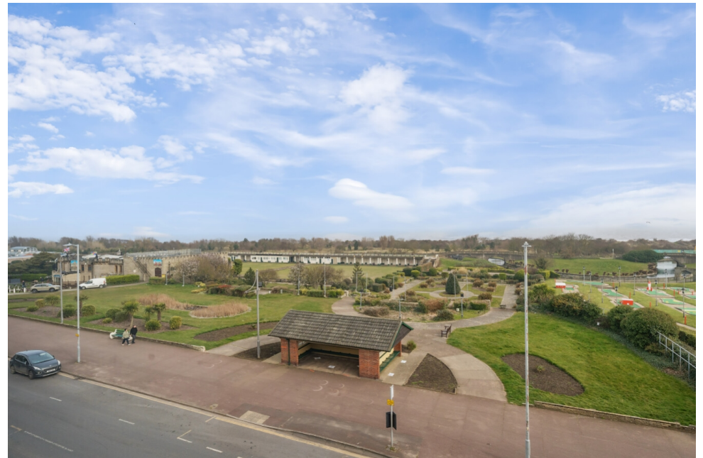
North Parade Hotel, 20 North Parade, Skegness, Lincolnshire, PE25 2UB