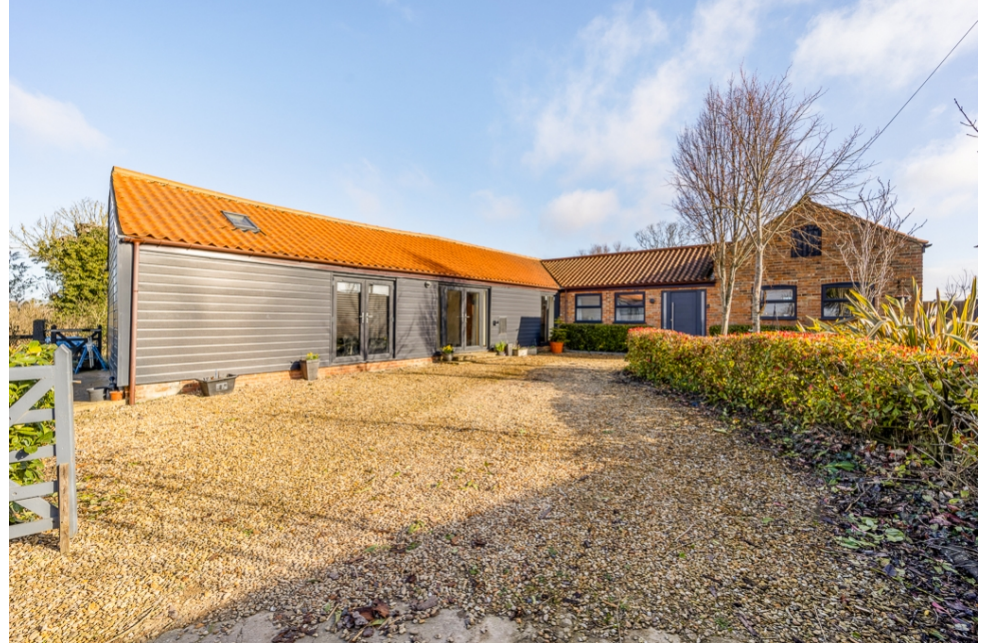
Fraglands Barn, Washdike Road, Algarkirk, Boston, Lincolnshire, PE20 2AW