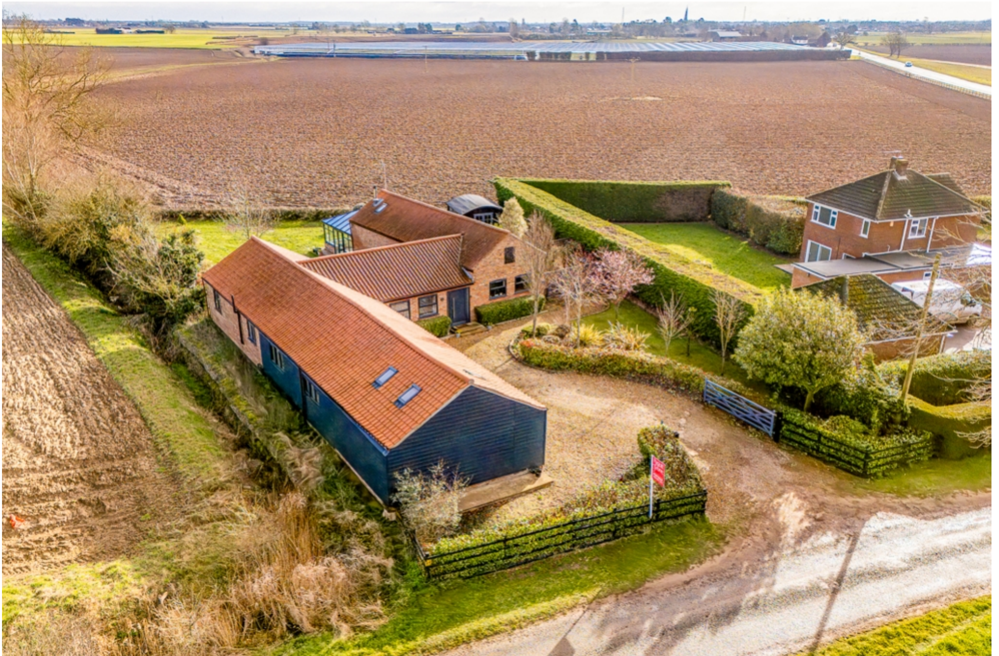
Fraglands Barn, Washdike Road, Algarkirk, Boston, Lincolnshire, PE20 2AW