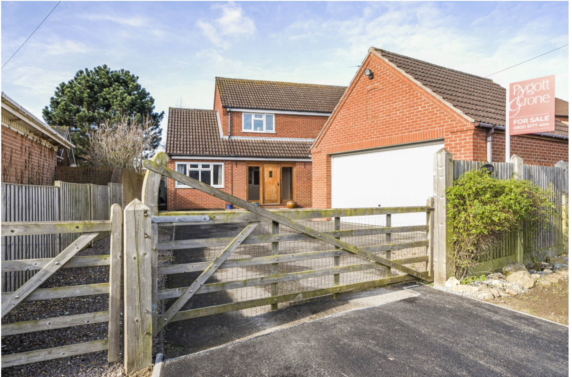
Merion, Main Road, Long Bennington, Nottinghamshire, NG23 5EH