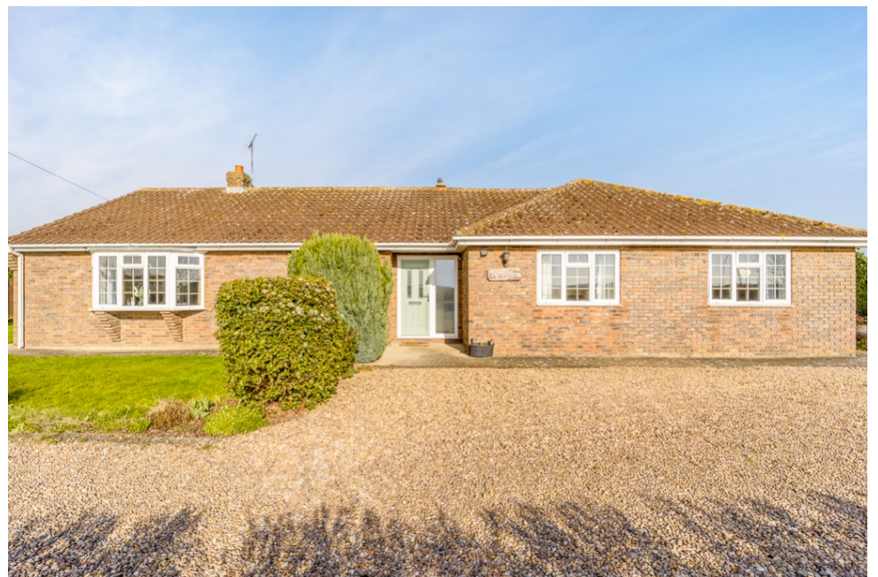
Keppel Gate, Chapel Lane, Amber Hill, Boston, Lincolnshire, PE20 3RJ