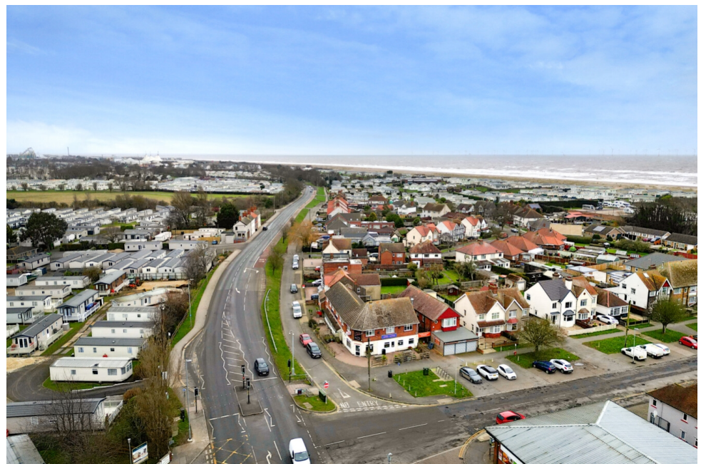
Linga Longa Fish & Chips , 1-3 Winthorpe Avenue, Skegness, Lincolnshire, PE25 1QY