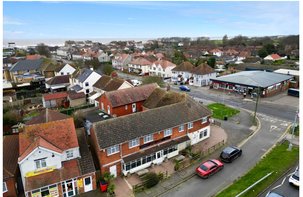
Linga Longa Fish & Chips , 1-3 Winthorpe Avenue, Skegness, Lincolnshire, PE25 1QY