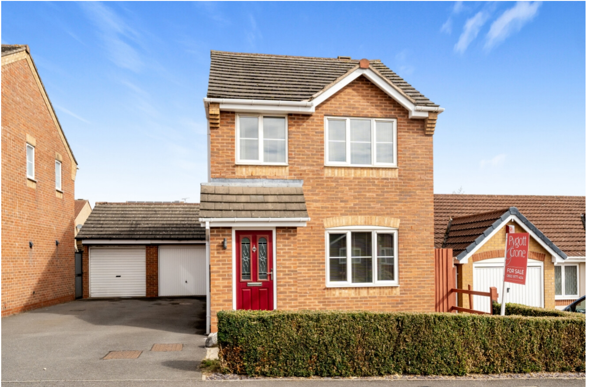
12 Bracken Road, Shirebrook, Mansfield, Nottinghamshire, NG20 8FB