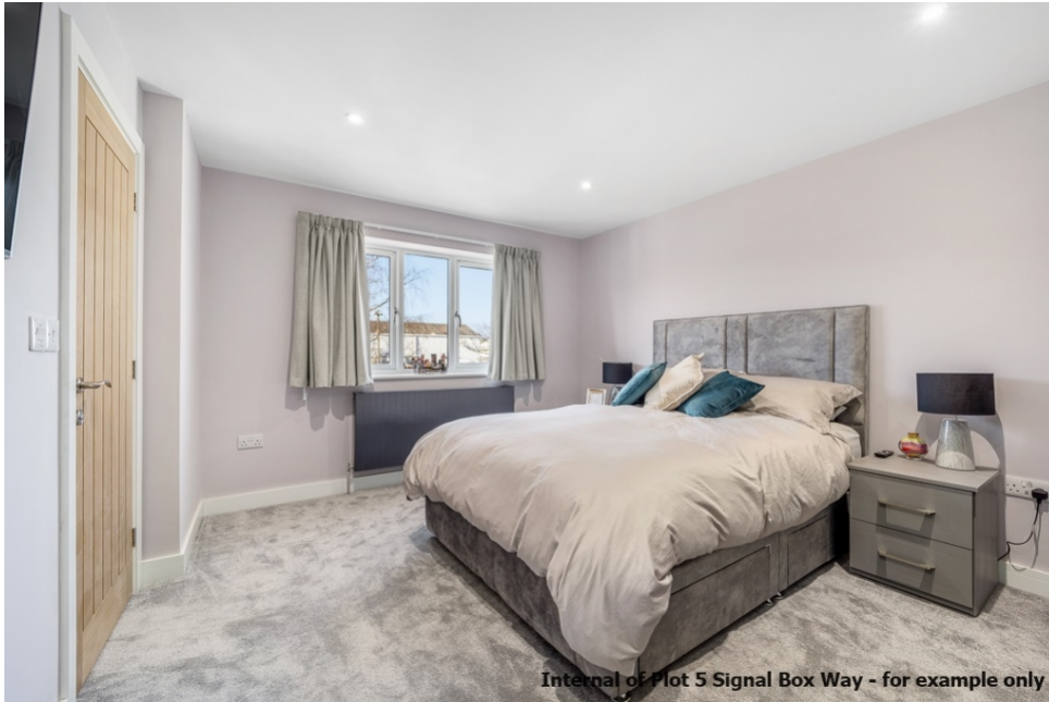
Internal of Plot 5 Signal Box Way - for example only