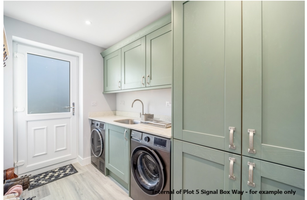
Internal of Plot 5 Signal Box Way - for example only