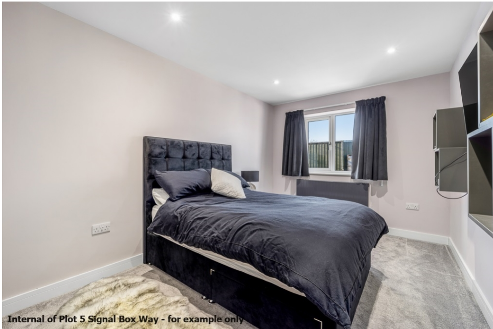
Internal of Plot 5 Signal Box Way - for example only