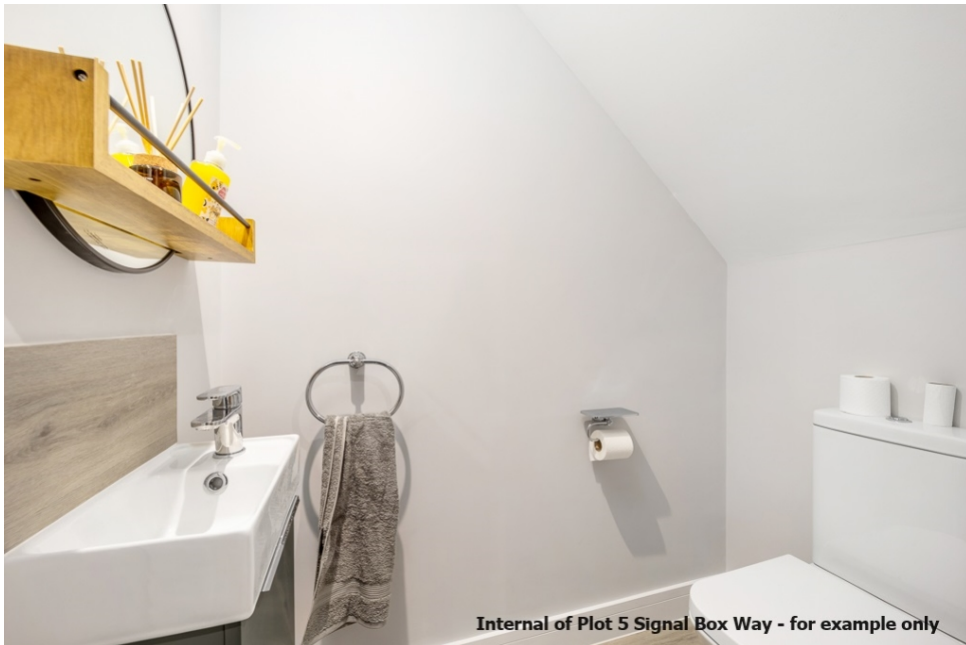
Internal of Plot 5 Signal Box Way - for example only