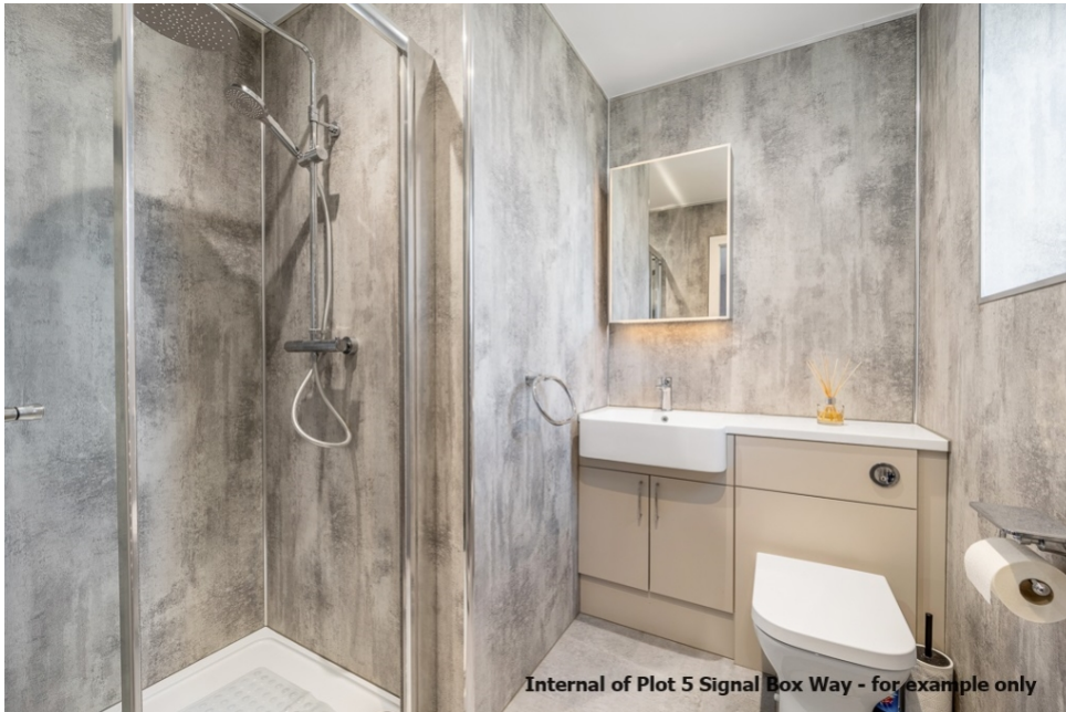
Internal of Plot 5 Signal Box Way - for example only