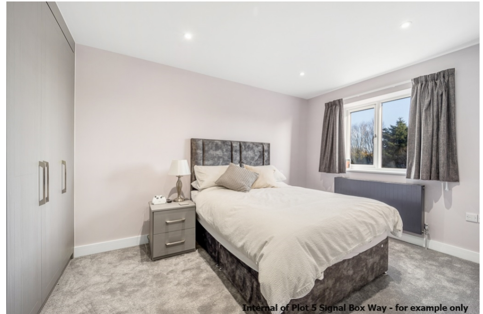
Internal of Plot 5 Signal Box Way - for example only