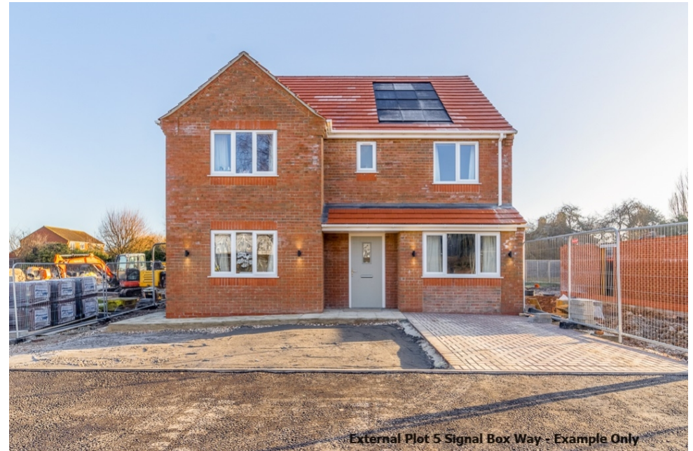
External Plot 5 Signal Box Way - Example Only