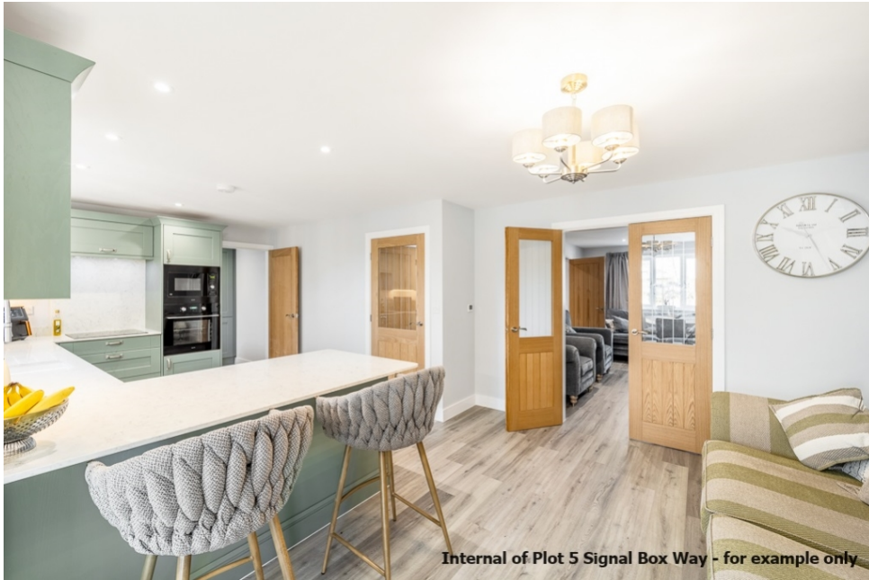
Internal of Plot 5 Signal Box Way - for example only