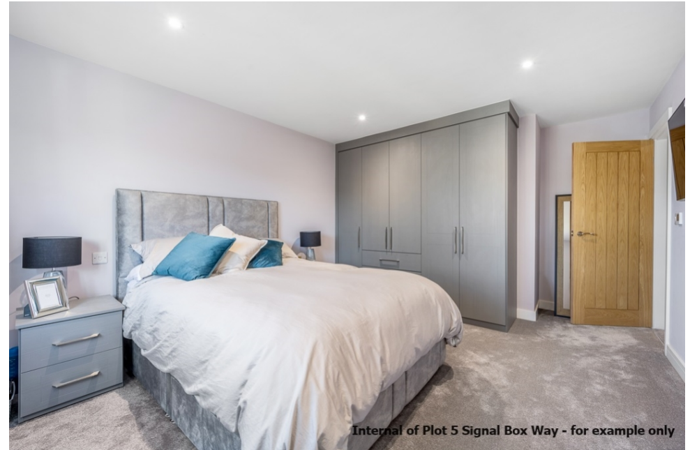
Internal of Plot 5 Signal Box Way - for example only