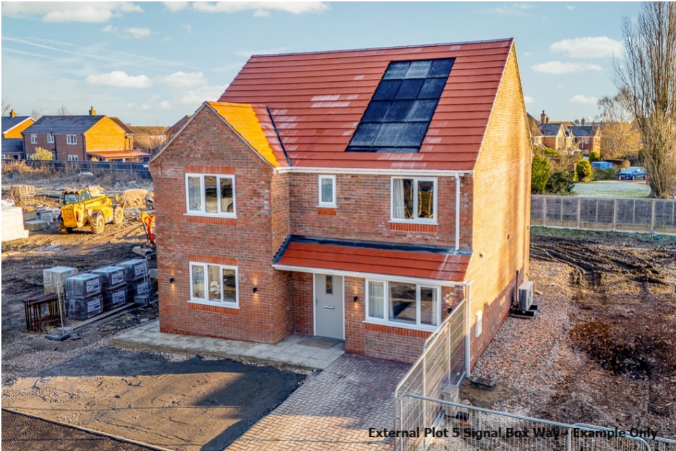
External Plot 5 Signal Box Way - Example Only