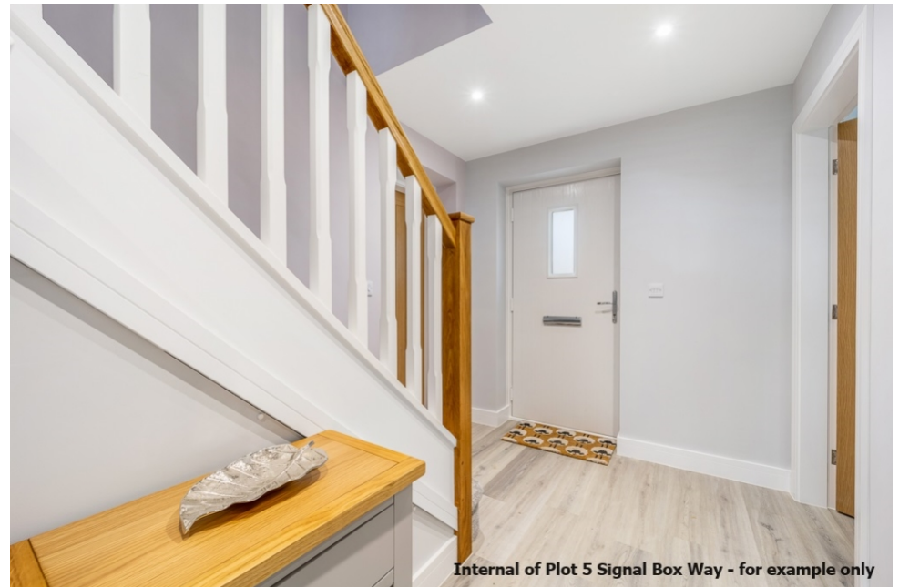
Internal of Plot 5 Signal Box Way - for example only