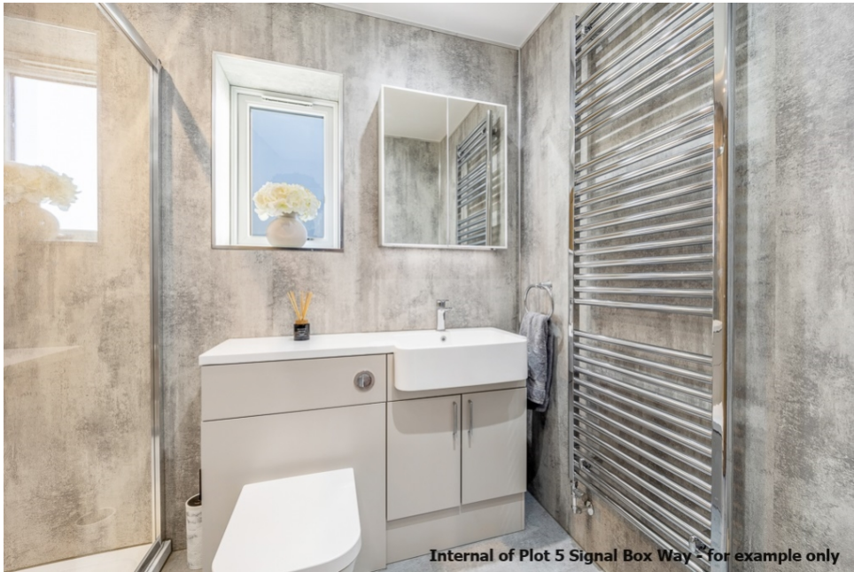
Internal of Plot 5 Signal Box Way - for example only