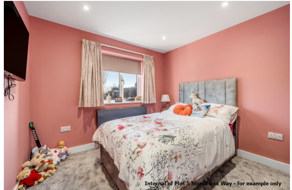
Internal of Plot 5 Signal Box Way - for example only