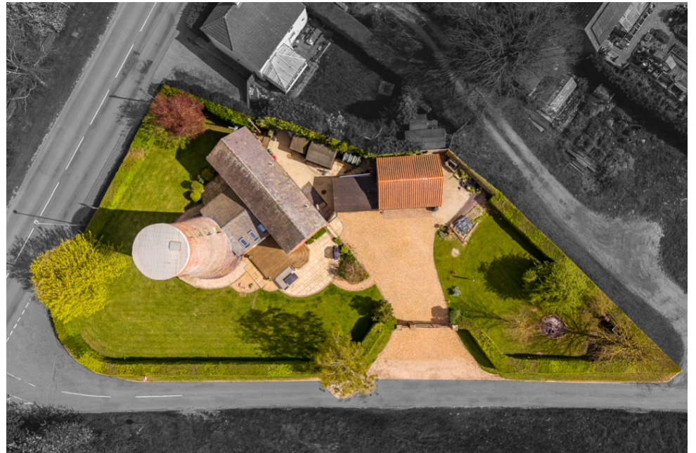
The Old Mill, Mill Lane, Sutterton, Boston, Lincolnshire, PE20 2EN