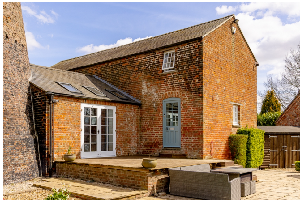
The Old Mill, Mill Lane, Sutterton, Boston, Lincolnshire, PE20 2EN