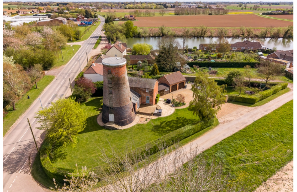
The Old Mill, Mill Lane, Sutterton, Boston, Lincolnshire, PE20 2EN