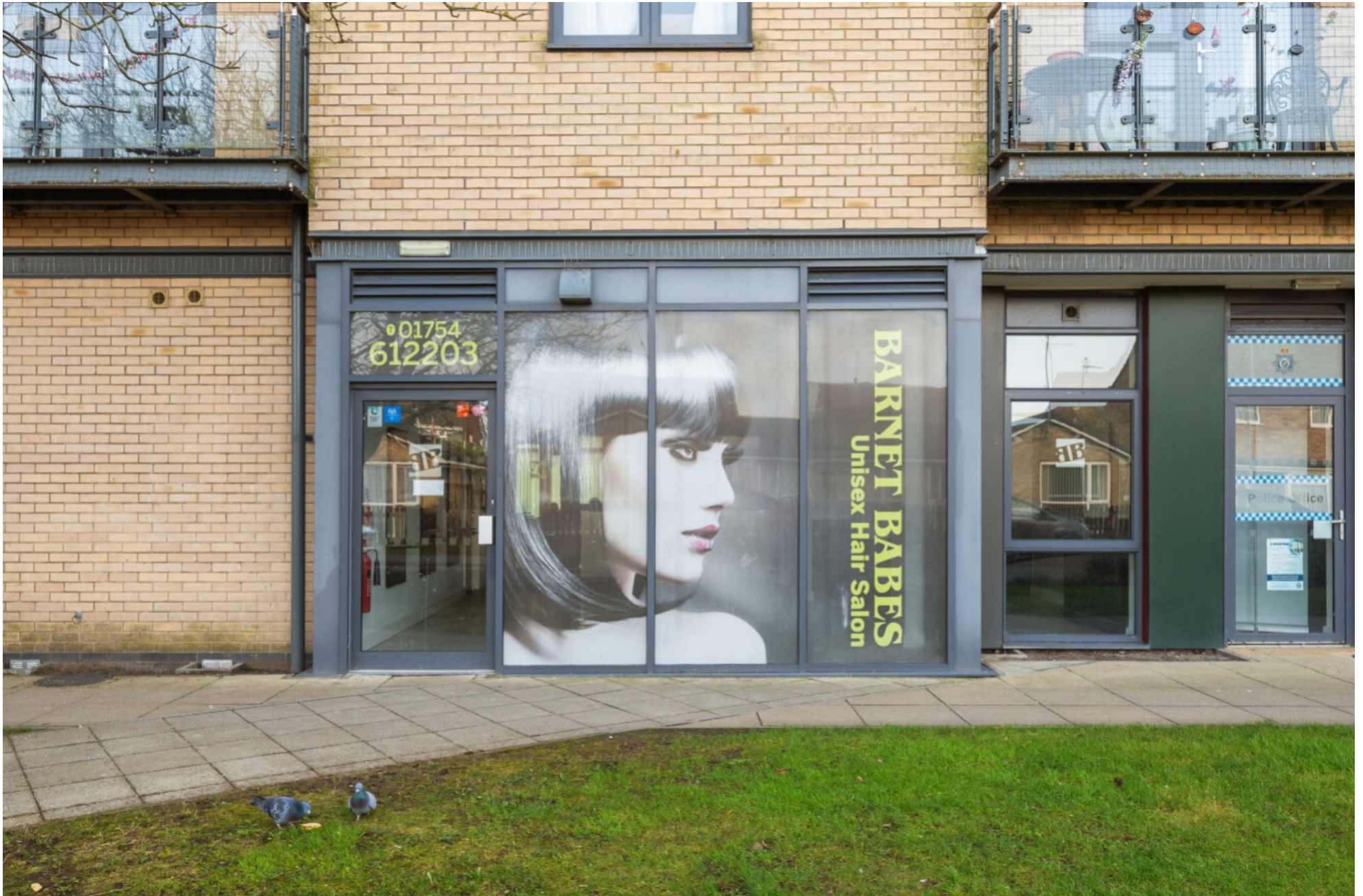
Hairsalon, Barratt Court, Skegness, Lincolnshire, PE25 2PQ