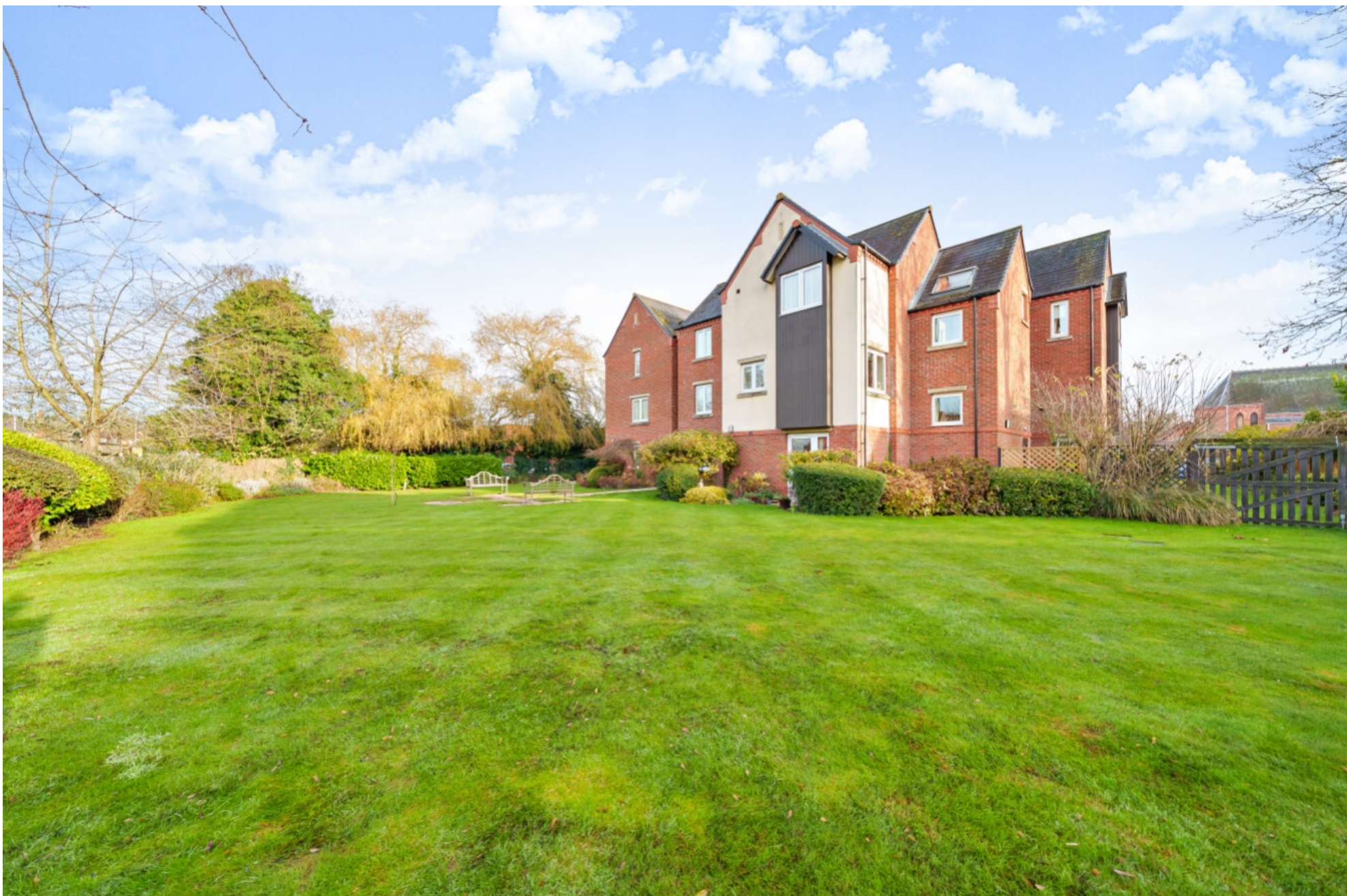
Flat 46, Moores Court, Jermyn Street, Sleaford, Lincolnshire, NG34 7UL