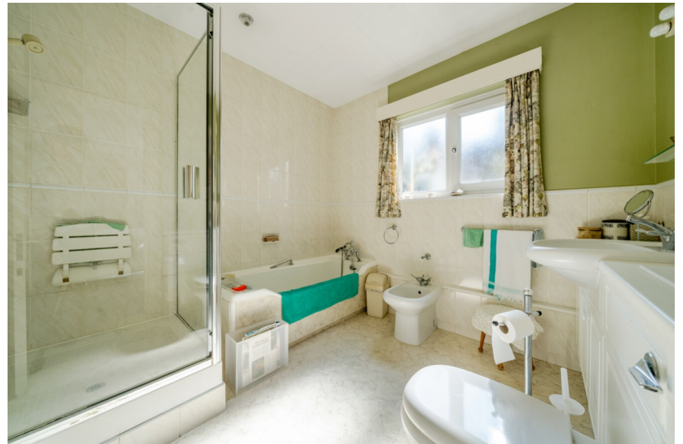
Deeping Cottage, Burton, Lincoln, Lincolnshire, LN1 2RD