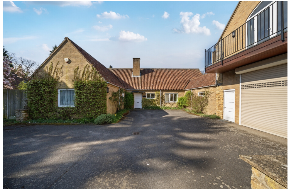
Deeping Cottage, Burton, Lincoln, Lincolnshire, LN1 2RD