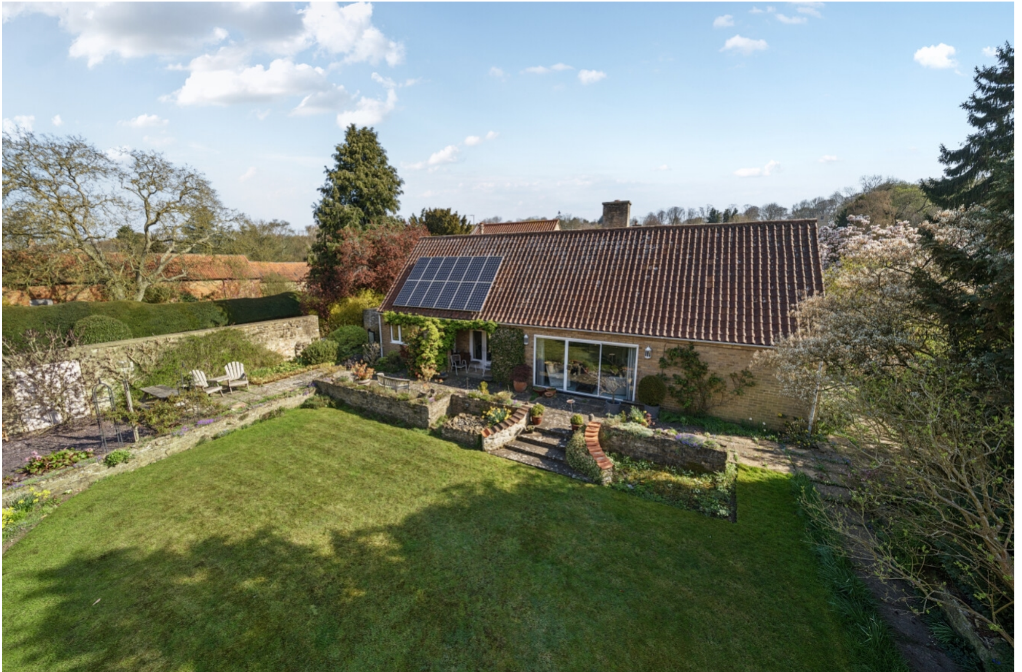
Deeping Cottage, Burton, Lincoln, Lincolnshire, LN1 2RD