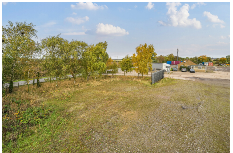
Haulage Yard/Workshops, Langrick Road, New York, Lincoln, Lincolnshire, LN4 4XH