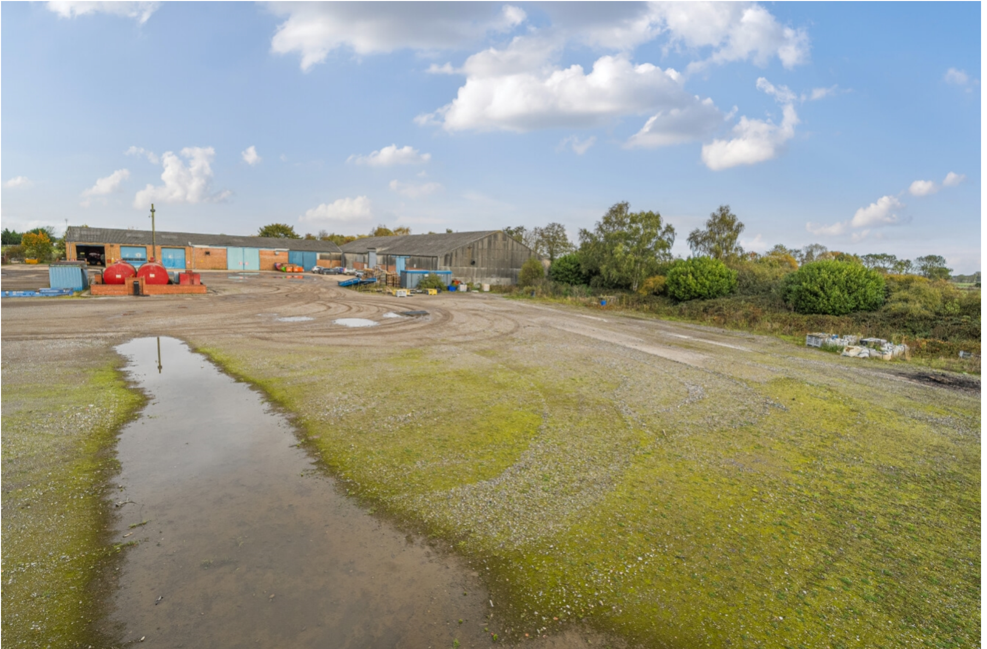
Haulage Yard/Workshops, Langrick Road, New York, Lincoln, Lincolnshire, LN4 4XH