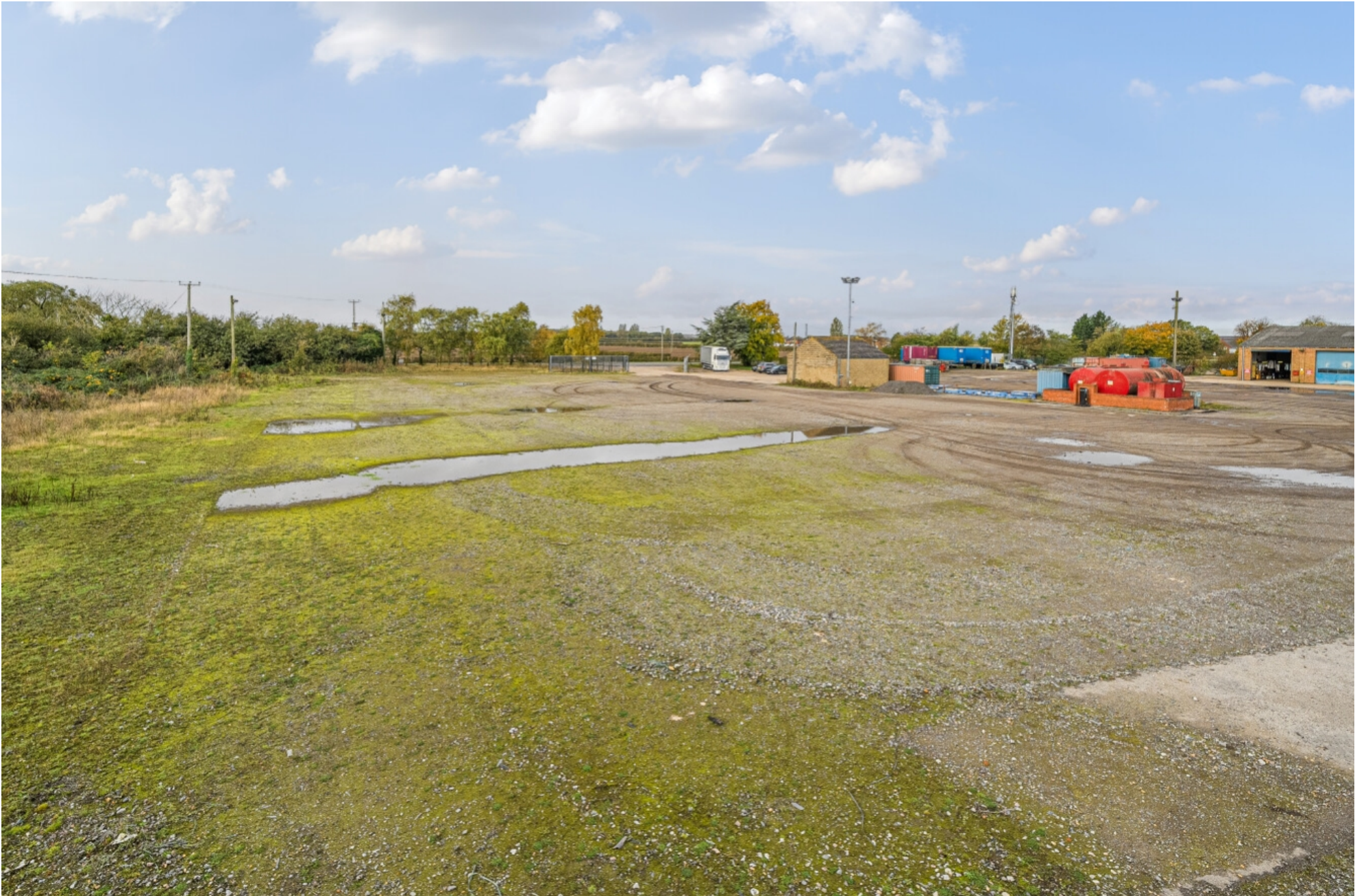
Haulage Yard/Workshops, Langrick Road, New York, Lincoln, Lincolnshire, LN4 4XH