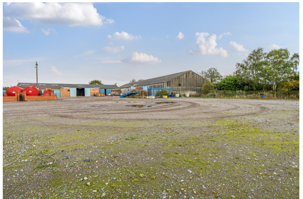
Haulage Yard/Workshops, Langrick Road, New York, Lincoln, Lincolnshire, LN4 4XH