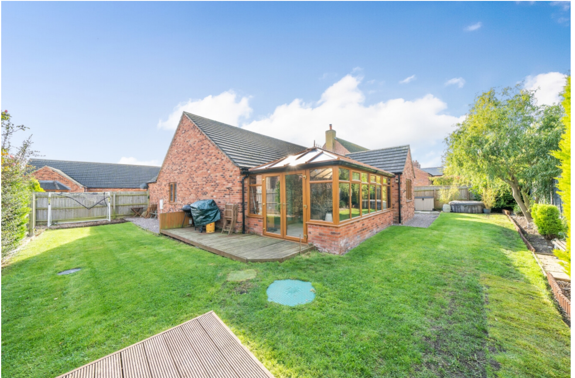
Riverview Lodge, 29b Low Road, South Kyme, Lincoln, Lincolnshire, LN4 4AG