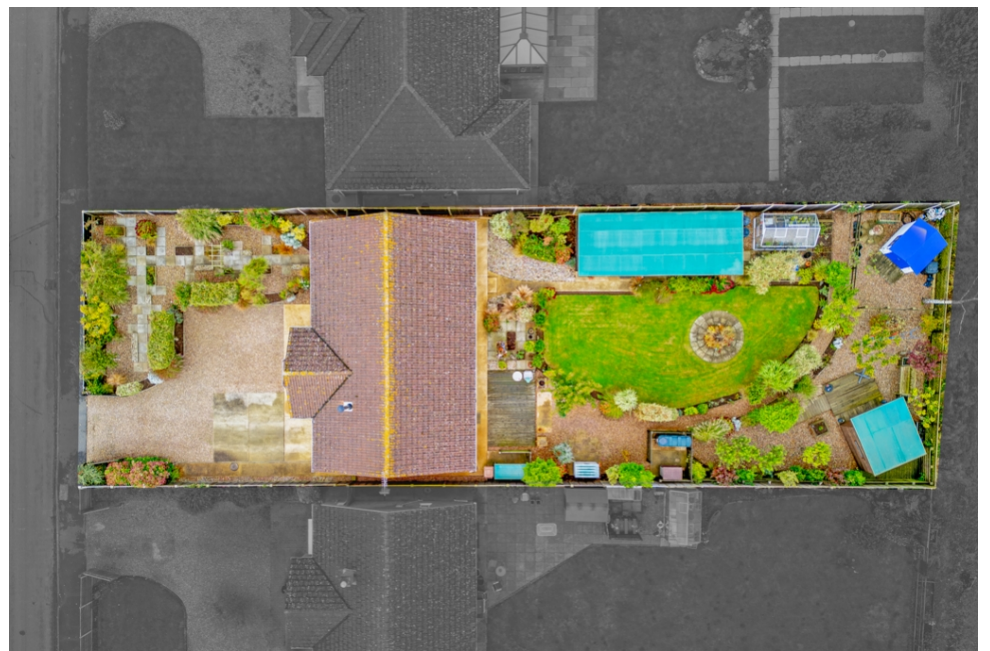
The Pantiles, Tooley Lane, Wrangle, Boston, Lincolnshire, PE22 9BL