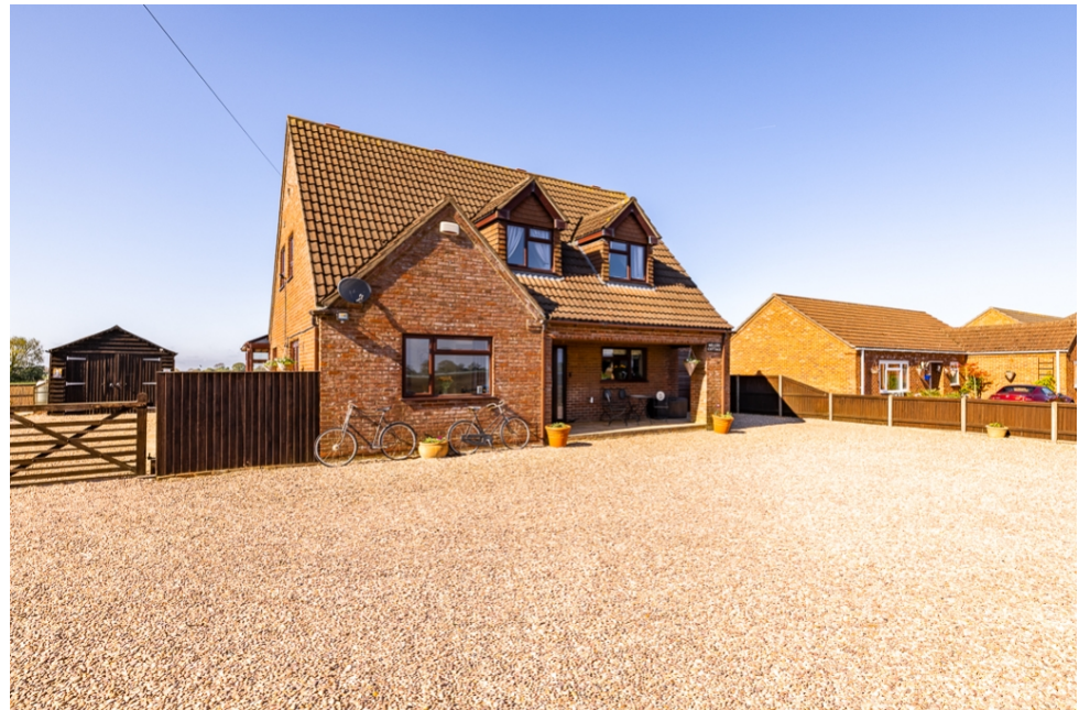
Millers Cottage, Field Lane, Friskney, Boston, Lincolnshire, PE22 8RH