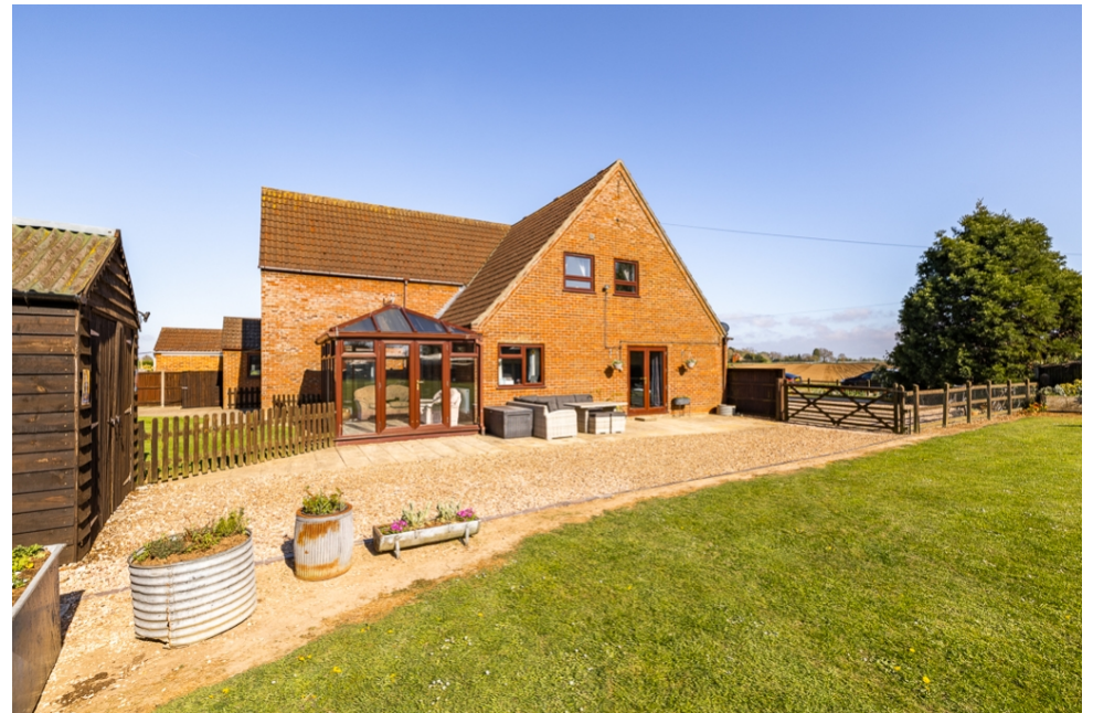
Millers Cottage, Field Lane, Friskney, Boston, Lincolnshire, PE22 8RH