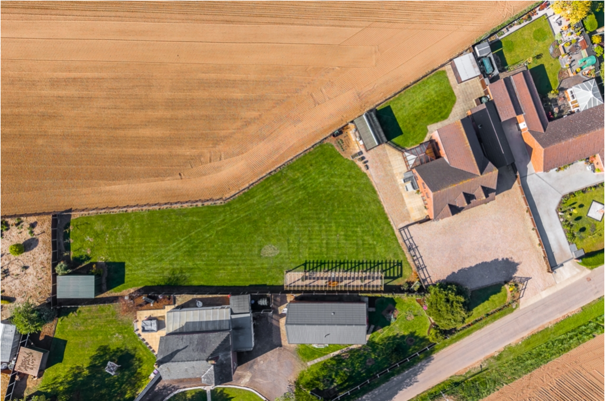
Millers Cottage, Field Lane, Friskney, Boston, Lincolnshire, PE22 8RH