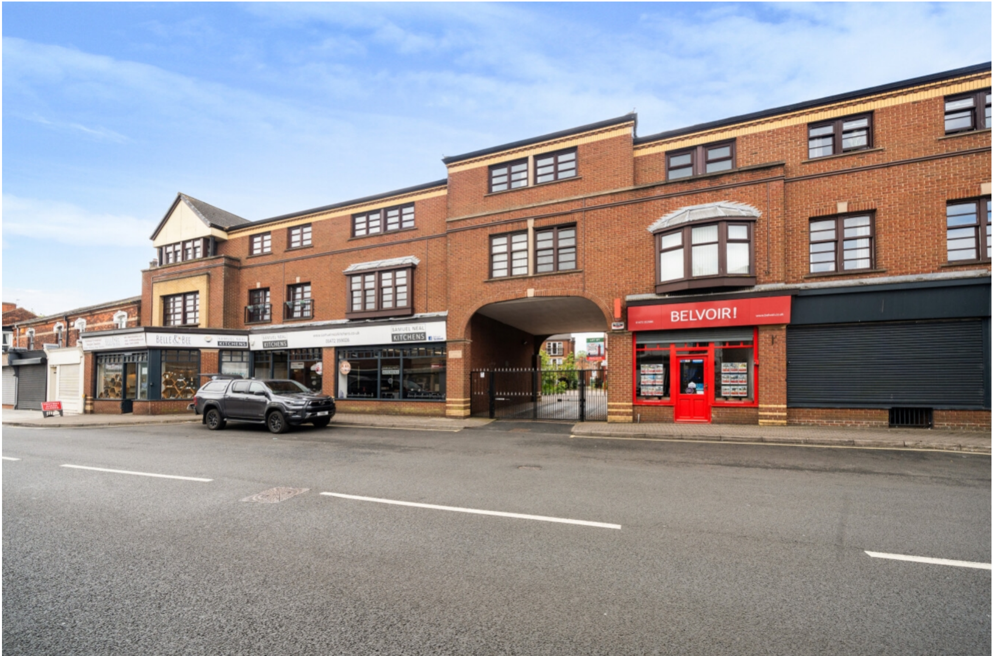
2 Wellowgate Mews, Grimsby, Lincolnshire, DN32 0RY