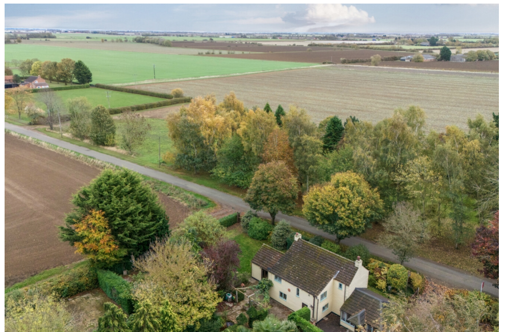
Maple Cottage, Littleworth Drive, Heckington Fen, Sleaford, Lincolnshire, NG34 9NE