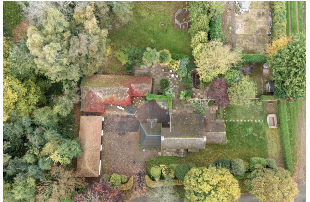
Maple Cottage, Littleworth Drive, Heckington Fen, Sleaford, Lincolnshire, NG34 9NE