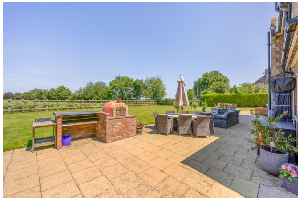
Glen Fairways, Reservoir Road, Surfleet, Spalding, Lincolnshire, PE11 4DH