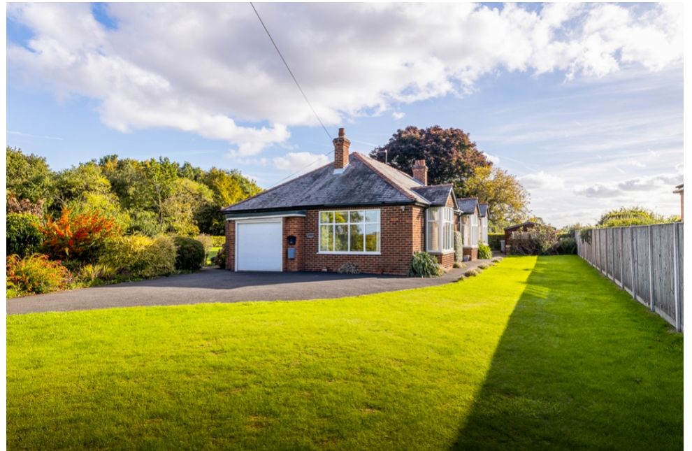
Southwood, London Road, Frampton, Boston, Lincolnshire, PE20 1BP