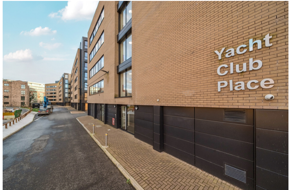
Apartment 50 Block C, Yacht Club Place, Trent Lane, Nottingham, Nottinghamshire, NG2 4RN