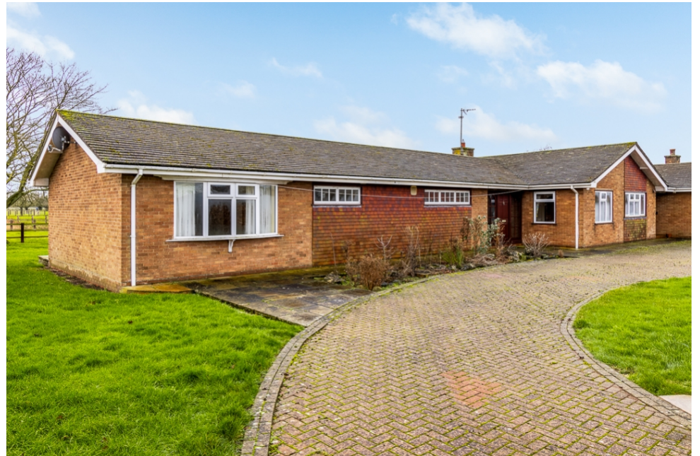
Mill Lodge, 40, School Lane, Old Leake, Boston, Lincolnshire, PE22 9NJ