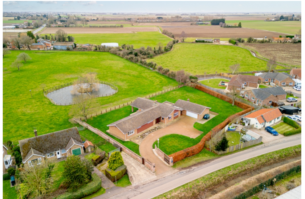
Mill Lodge, 40, School Lane, Old Leake, Boston, Lincolnshire, PE22 9NJ