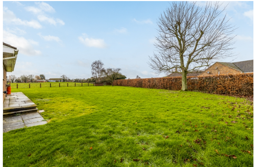
Mill Lodge, 40, School Lane, Old Leake, Boston, Lincolnshire, PE22 9NJ