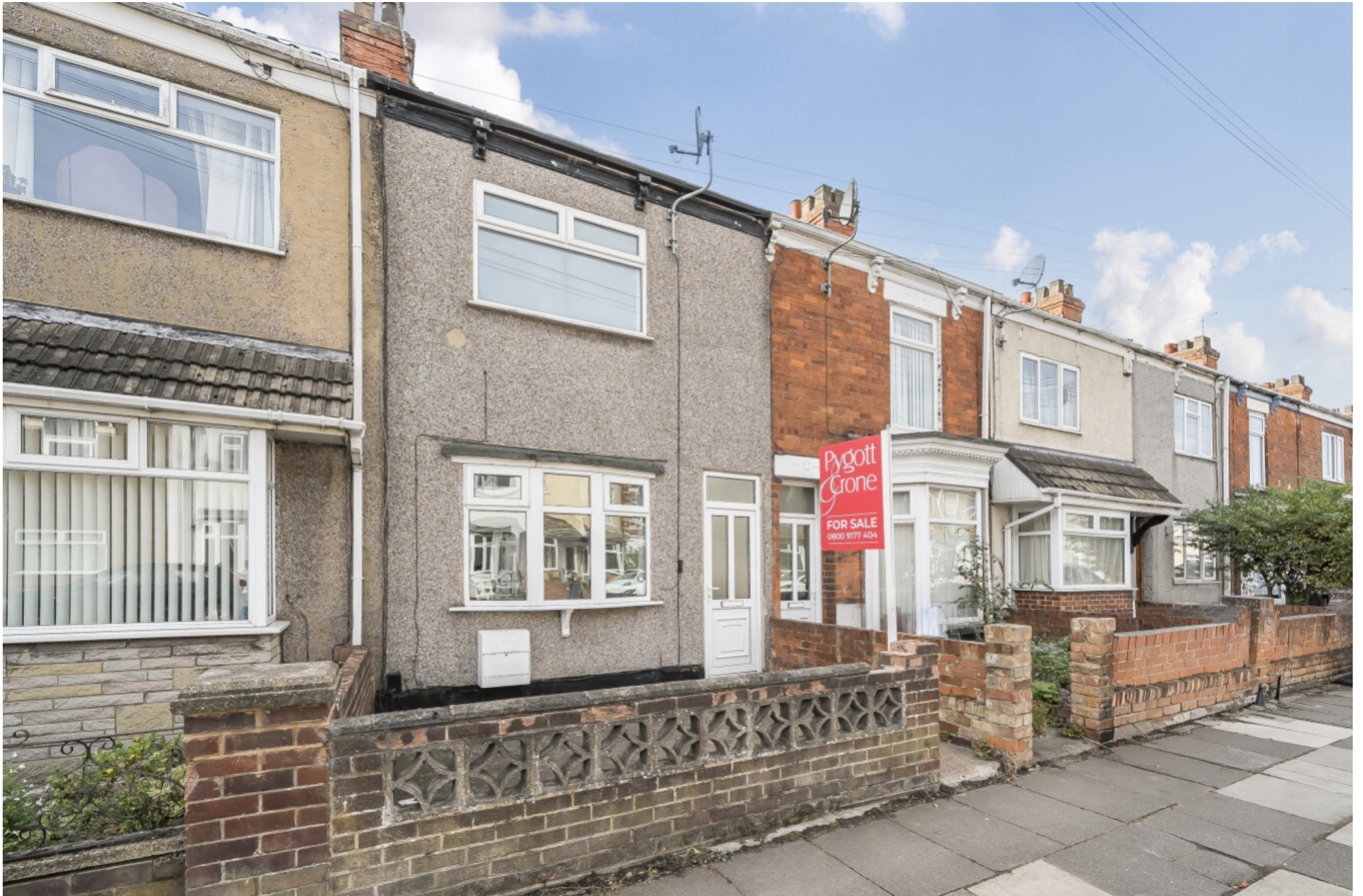
52 Freeston Street, Cleethorpes, Lincolnshire, DN35 7NX