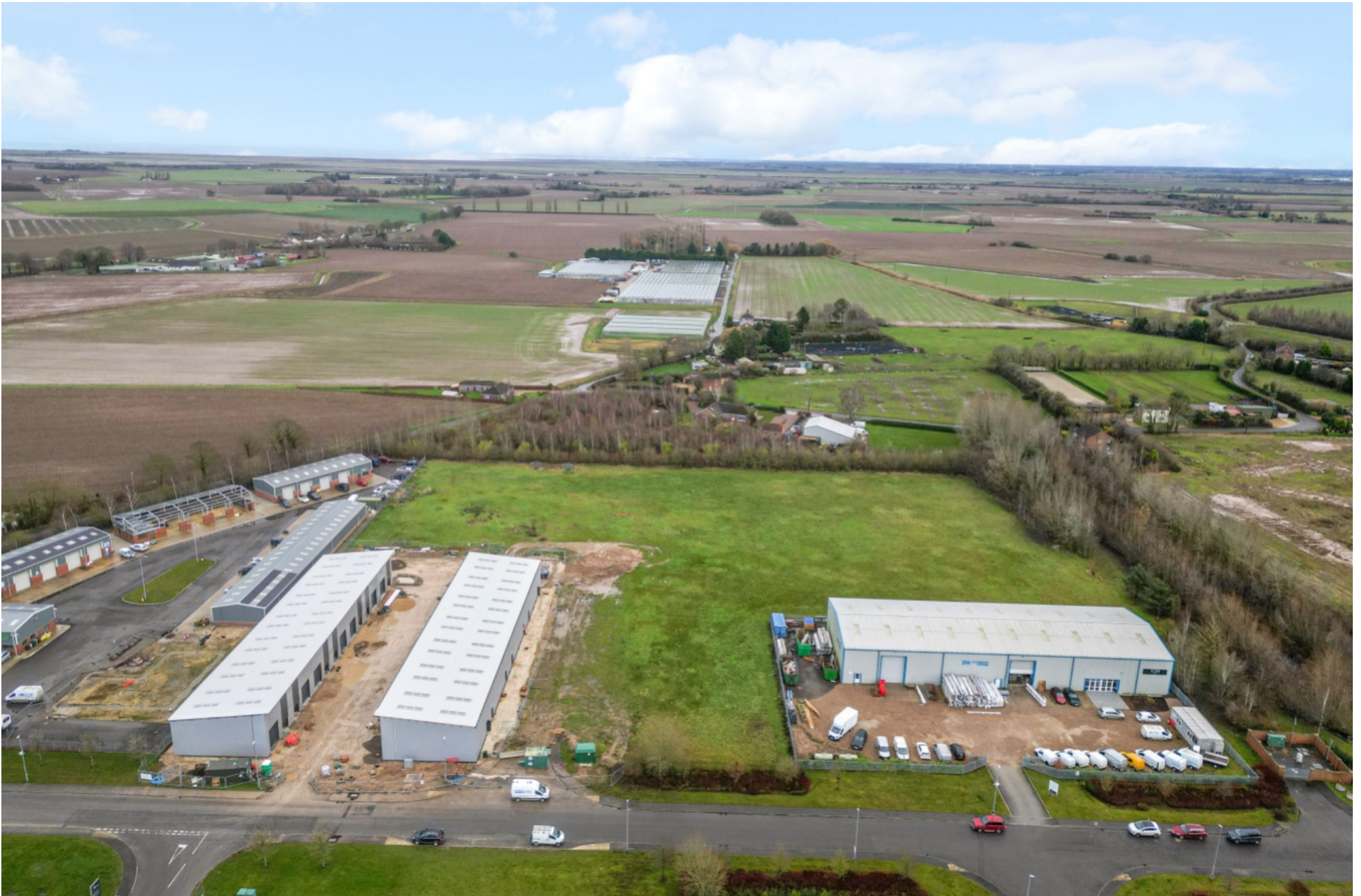
Stonebridge Business Park, Avalon Road, Kirton, Boston, Lincolnshire, PE20 1QR