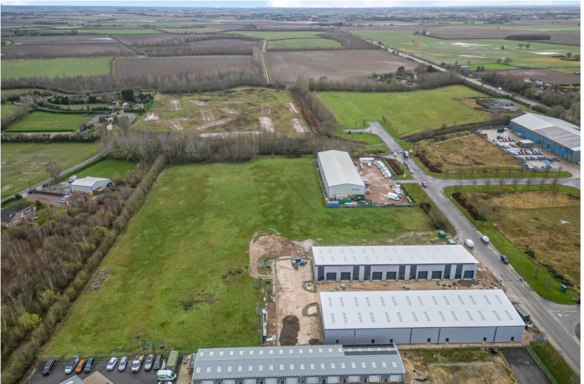
Stonebridge Business Park, Avalon Road, Kirton, Boston, Lincolnshire, PE20 1QR