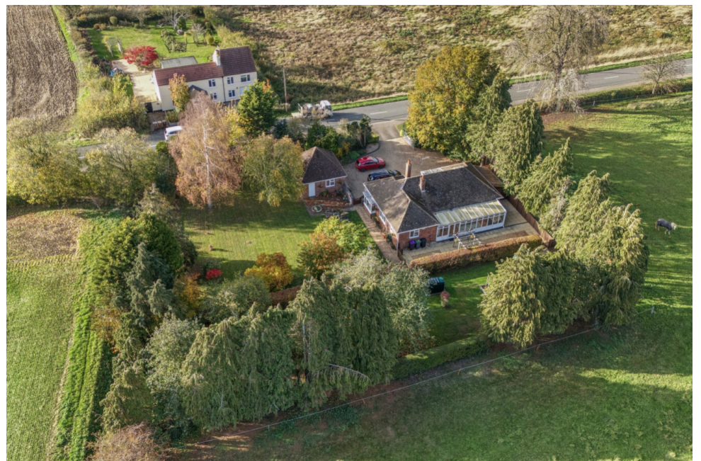
The Bungalow, Main Road, Little Hale, Sleaford, Lincolnshire, NG34 9BB