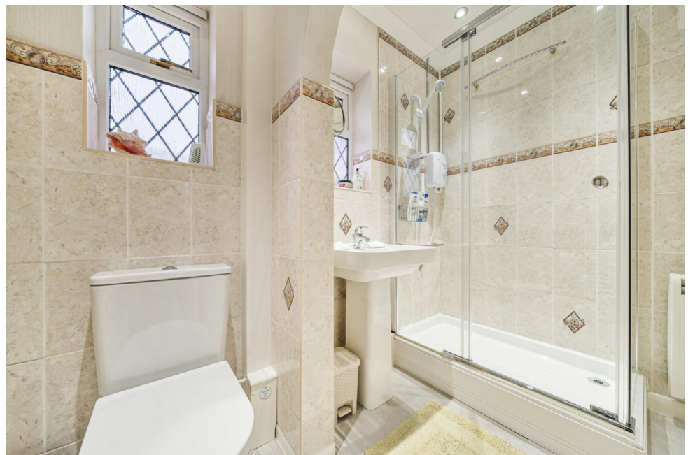
The Bungalow, Main Road, Little Hale, Sleaford, Lincolnshire, NG34 9BB