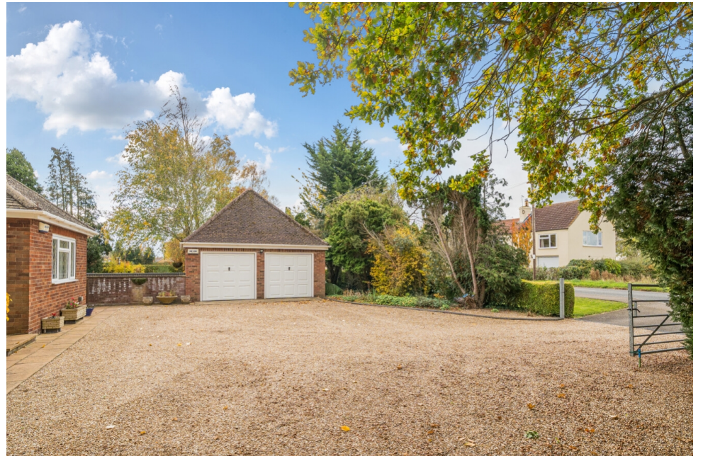
The Bungalow, Main Road, Little Hale, Sleaford, Lincolnshire, NG34 9BB