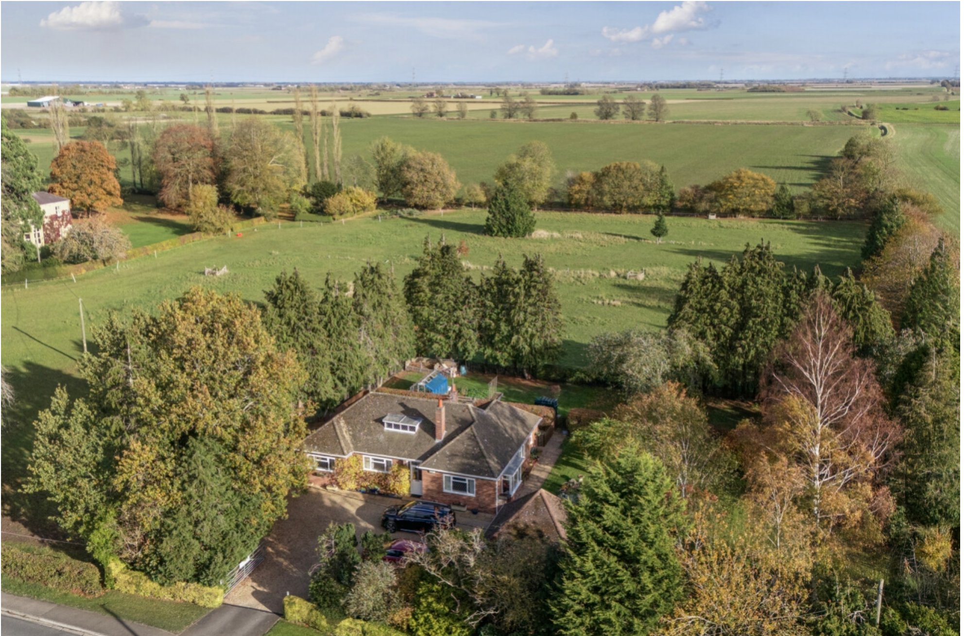
The Bungalow, Main Road, Little Hale, Sleaford, Lincolnshire, NG34 9BB