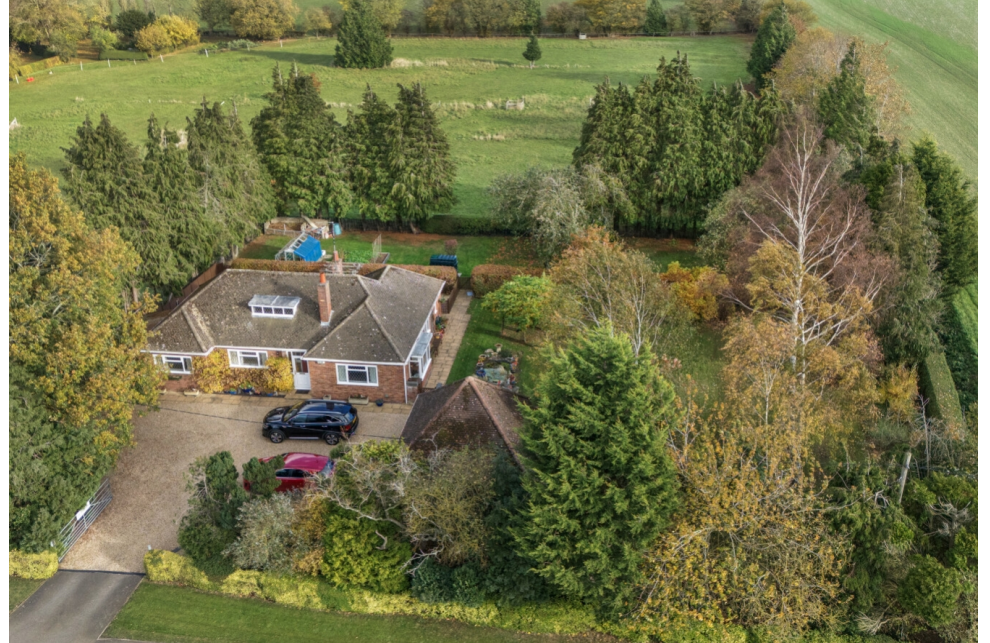
The Bungalow, Main Road, Little Hale, Sleaford, Lincolnshire, NG34 9BB