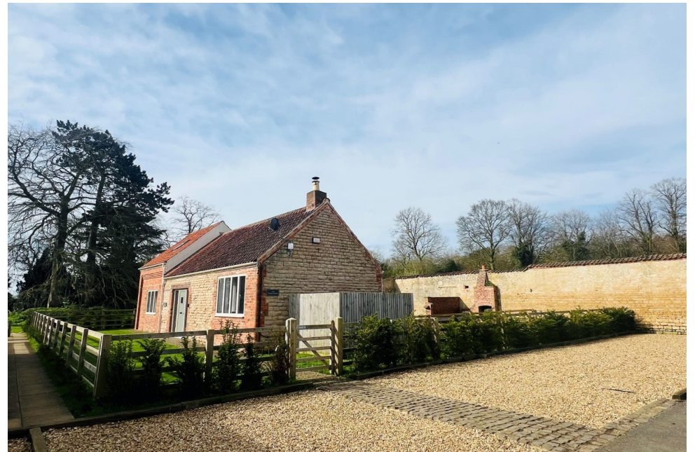
The Walled Garden, Welby Warren, Grantham, Lincolnshire, NG32 3AA