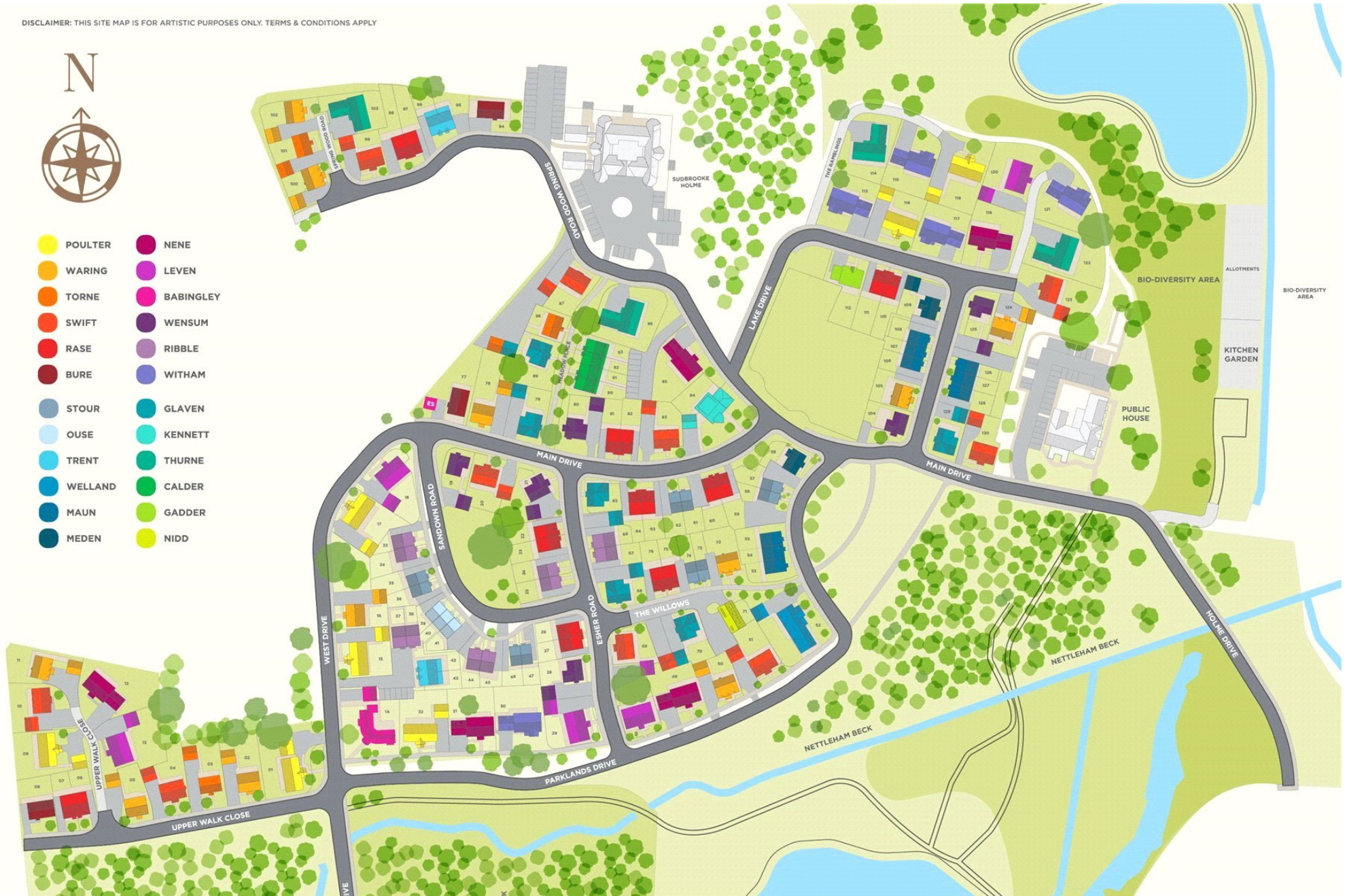
Plot 38 The Ribble, 38 West Drive, The Parklands, Sudbrooke, Lincoln, Lincolnshire, LN2 2RA