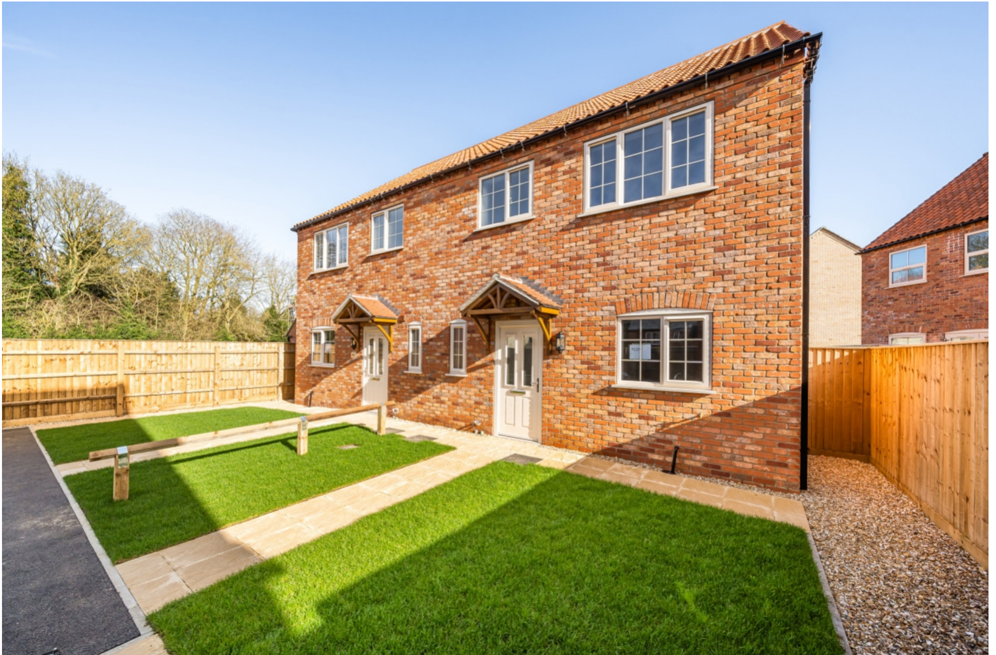
Plot 38 The Ribble, 38 West Drive, The Parklands, Sudbrooke, Lincoln, Lincolnshire, LN2 2RA