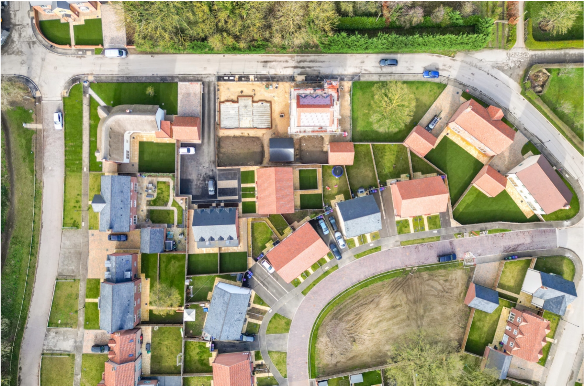
Plot 14, Babingley, The Parklands, 32 West Drive, Sudbrooke, Lincoln, LN2 2RA