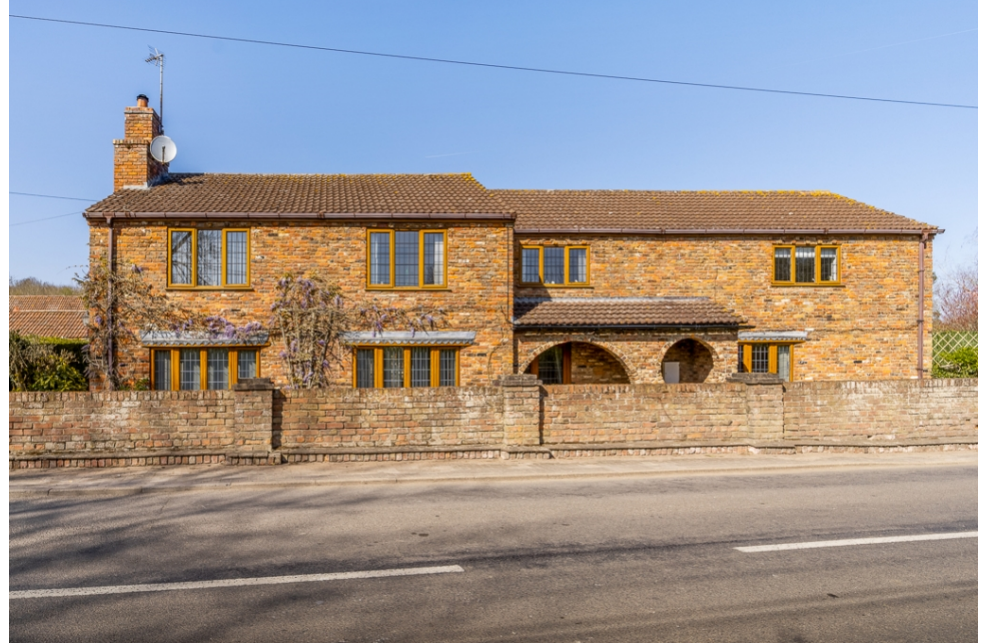
Sunshine House, Orby, Spilsby, PE23 5SW