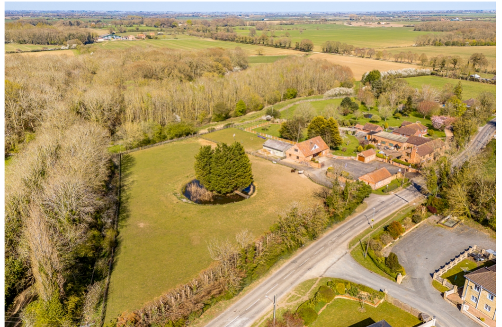
Sunshine House, Orby, Spilsby, PE23 5SW