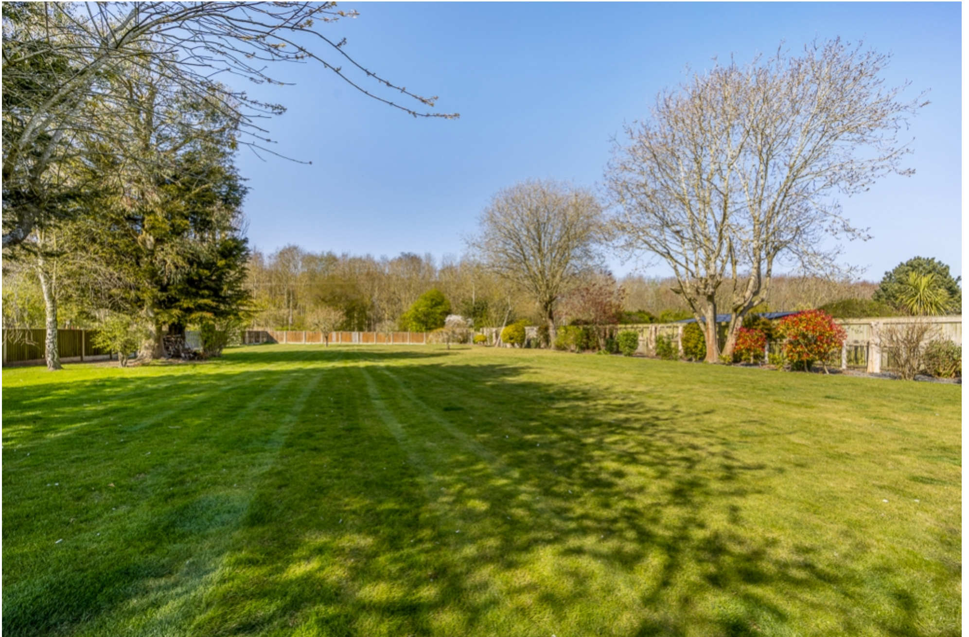
Sunshine House, Orby, Spilsby, PE23 5SW