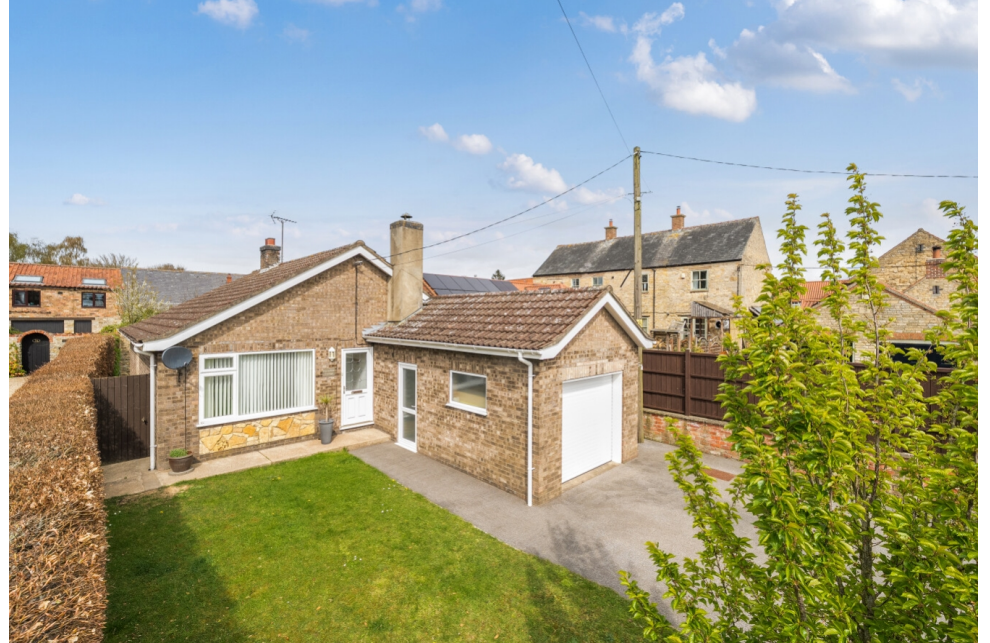
Horseshoe Cottage, Church Lane, Navenby, Lincoln, Lincolnshire, LN5 0EG