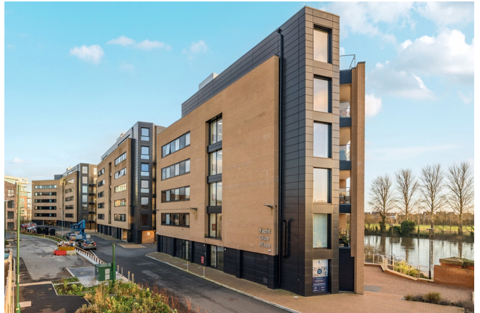
Apartment 39 Block B, Yacht Club Place, Trent Lane, Nottingham, Nottinghamshire, NG2 4RN