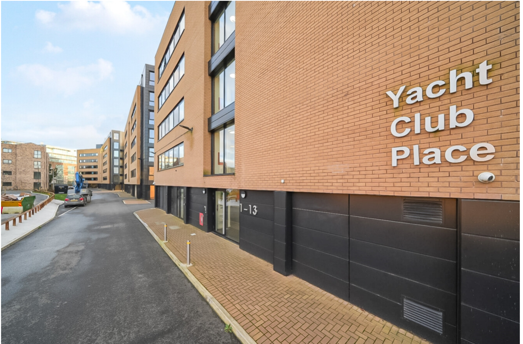
Apartment 78 Block C, Yacht Club Place, Trent Lane, Nottingham, Nottinghamshire, NG2 4RN