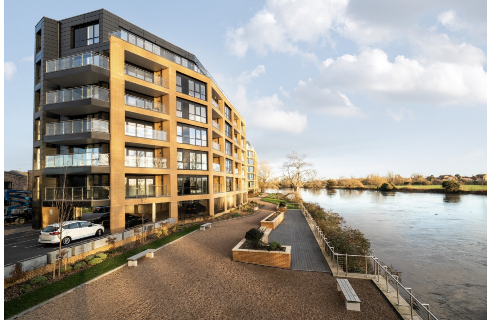
Apartment 78 Block C, Yacht Club Place, Trent Lane, Nottingham, Nottinghamshire, NG2 4RN