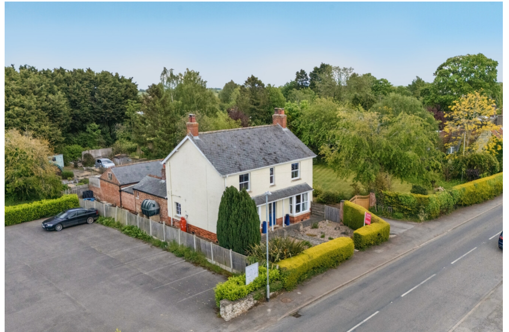
Kyme House, 20 High Street, Pointon, Sleaford, Lincolnshire, NG34 0LX