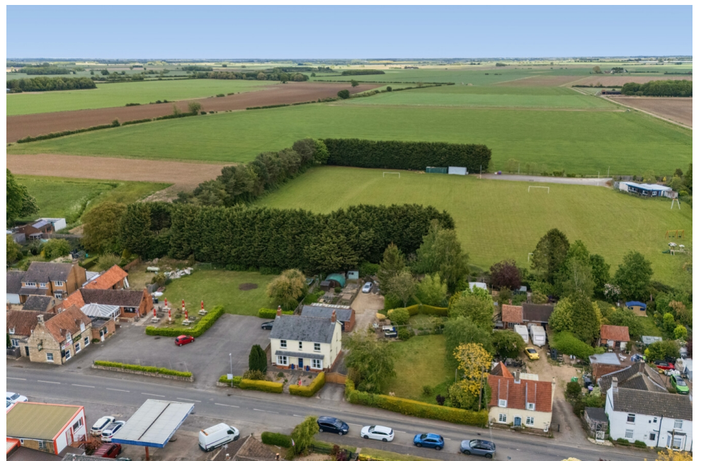
Kyme House, 20 High Street, Pointon, Sleaford, Lincolnshire, NG34 0LX