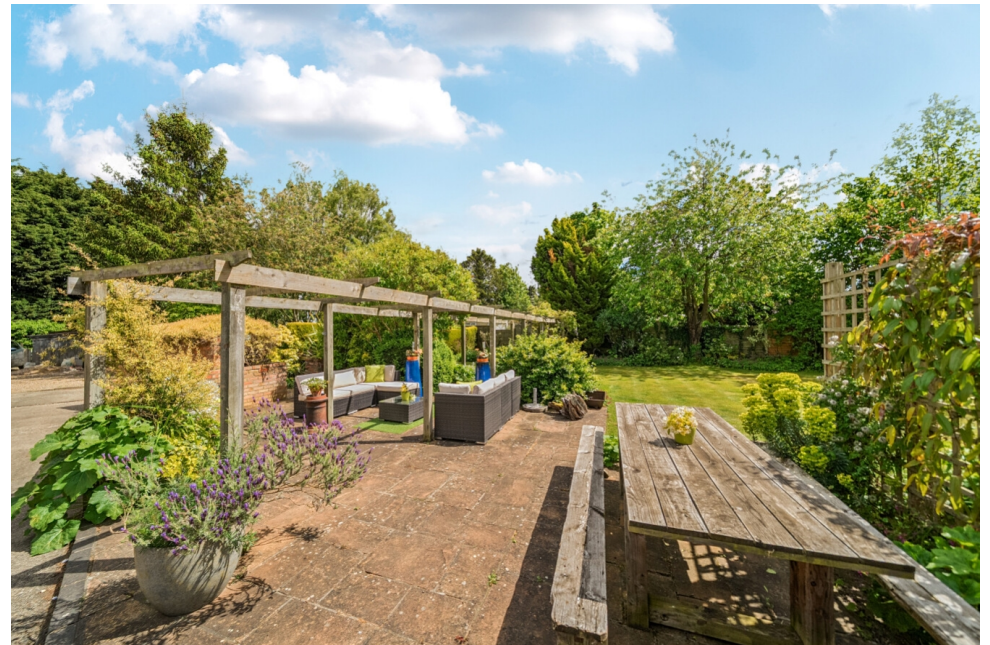
Kyme House, 20 High Street, Pointon, Sleaford, Lincolnshire, NG34 0LX