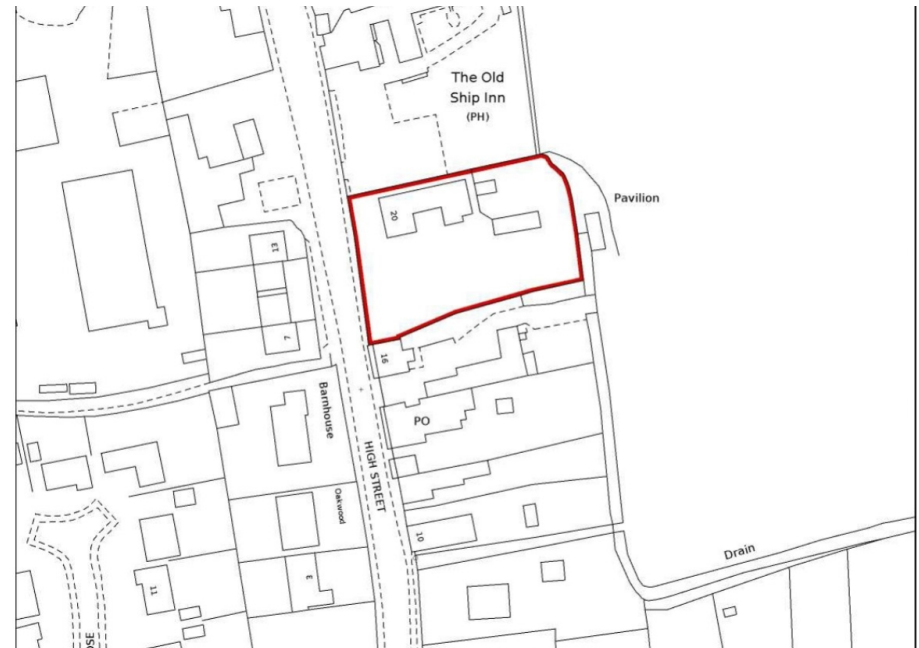
Kyme House, 20 High Street, Pointon, Sleaford, Lincolnshire, NG34 0LX