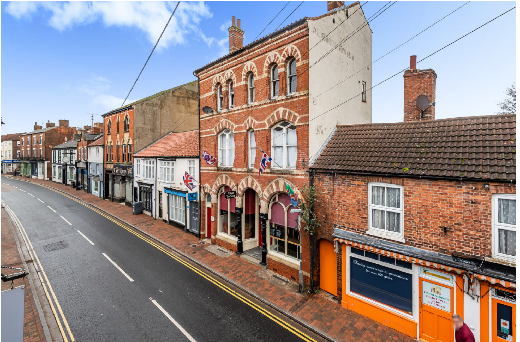
Albion House, 41 Queen Street, Market Rasen, Lincolnshire, LN8 3EN