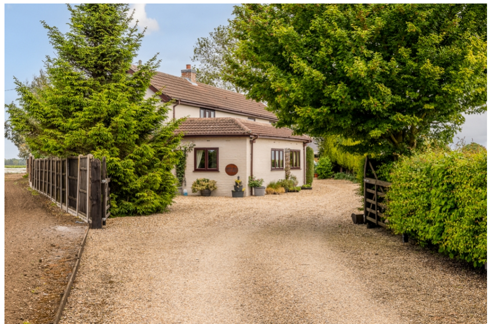
Chestnut Cottage, Deers Leap Road, Tumby Woodside, Boston, PE22 7SE