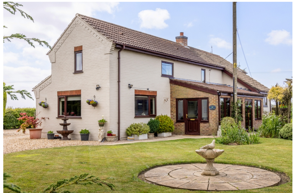
Chestnut Cottage, Deers Leap Road, Tumby Woodside, Boston, PE22 7SE